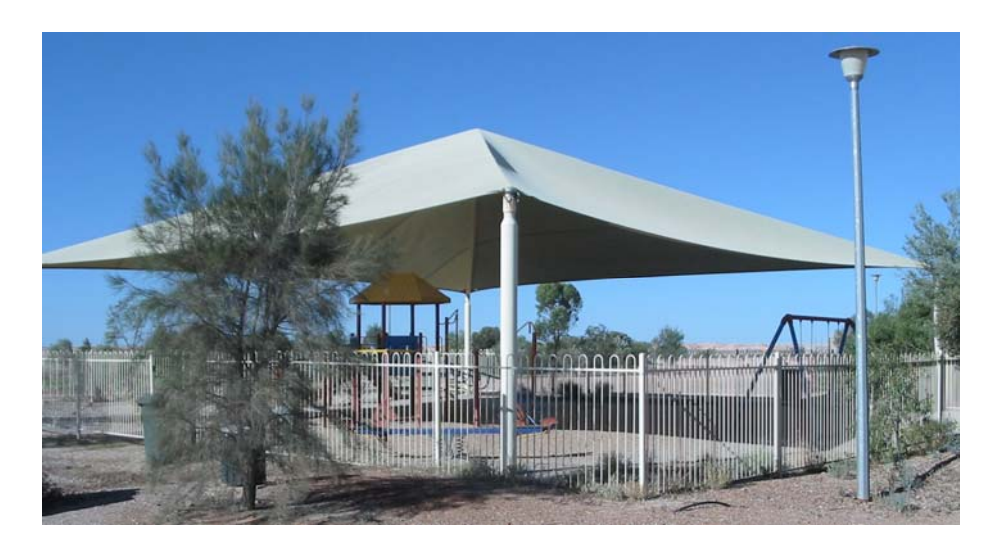
Children's playground located in the Triangle recreation area

The total number of persons who had used the Internet in the week preceding the 2001 Census was 662.