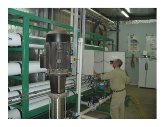
Alex Morgan checking filter membrane instruments

The town reticulation system is showing signs of age, with some ductile iron fittings and valves rusting, occasional causing smelly discoloured water. Water Supply staff are replacing fittings and repairing leaks continually in an effort to maintain the standards consumers are used to. However some interruptions to supply and small amounts of discoloured water are inevitable. Water Supply staff urge consumers to notify council of water quality the irregularities and suspected system leaks (damp patches on ground) to enable prompt attention by staff.