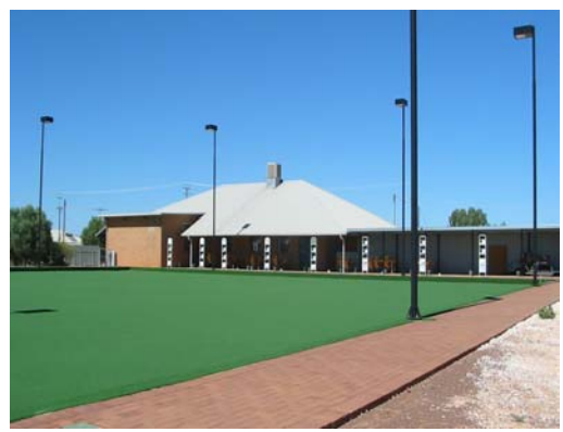
United Bowling & Sports Association outdoor bowls area - funded with the assistance of the Regional Solutions Program

Amongst these is the establishment of a peak industry body that would be representative of opal miners. A Discussion Paper about the peak industry body and draft Constitution was prepared and distributed widely in South Australia's opal mining fields prior to industry meetings held at Andamooka, Coober Pedy, Lambina and Mintabie.