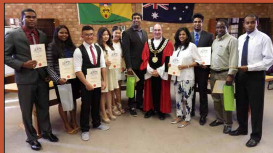
Citizenships 25 June 2014 Congratulations to all those who took the pledge