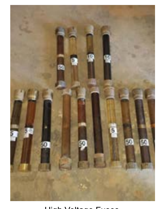
High Voltage Fuses