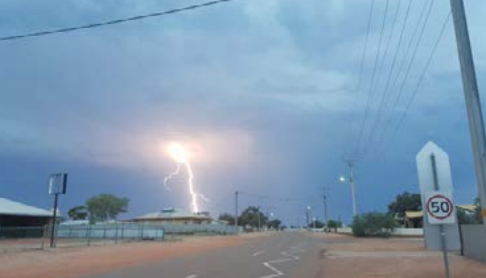
Photo from the lightning storm on Monday 18th December 2017

For Monday Christmas Day 25th December 2017 & Tuesday Boxing Day 26th December 2017 your bin will be collected