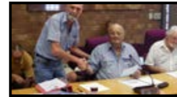
Boro being sworn in for another term in 2014