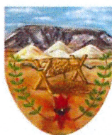
District Council of Coober Pedy

By-law made under the Local Government Act 1999